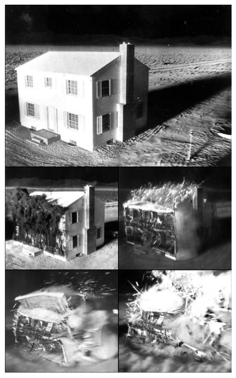
FIGURE 16.1 Stills from footage of Operation Doorstep, showing one of the model houses demolished by a shock wave, 1953.

<i><i>Modernism, Christianity and Apocalypse</i>, BRILL, 2014. ProQuest Ebook Central, http://ebookcentral.proquest.com/lib/adelaide/detail.action?docID=1840856. Created from adelaide on 2019-06-28 03:55:44.