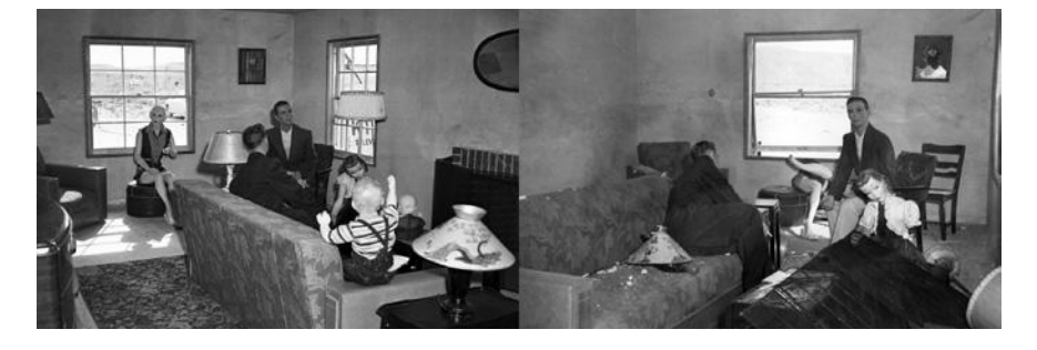
FIGURE 16.2 Scenes from inside one of the Operation Doorstep houses, before and after the nuclear detonation, 1953.

occasion."<sup>7</sup> From "occasion" we can extrapolate that the poem can only issue from a specific time and place; but a "cry," defined by the OED as a "chiefly inarticulate utterance," complicates the picture. The poem may issue from a specific time and place, but the relationship between that context and the content of the poem—if this view even admits of any content at all—must remain